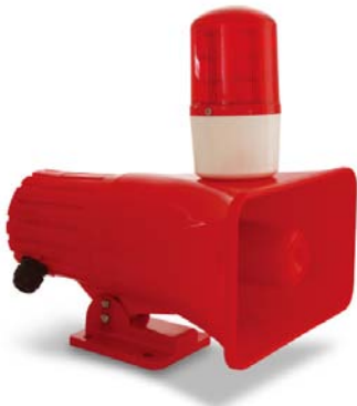
BC-3B with junction box